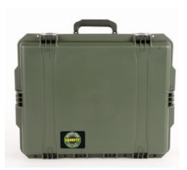
Hard Case for Compact Kit Part No. 1624400