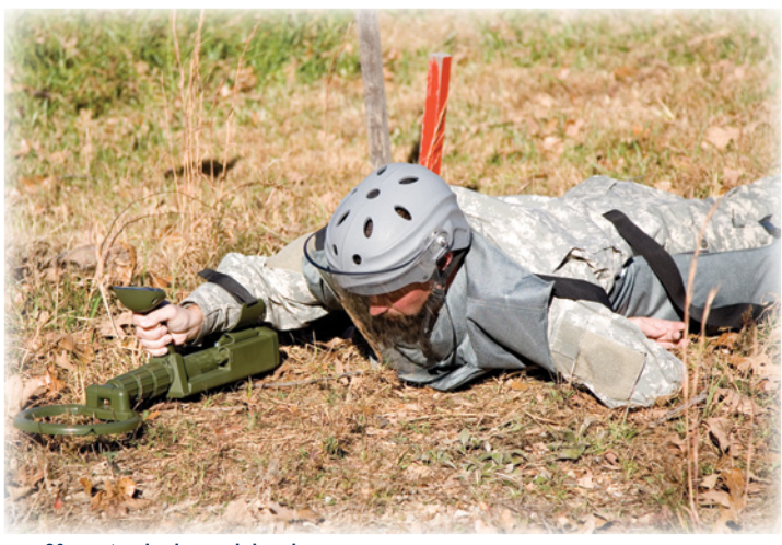
20cm standard search head