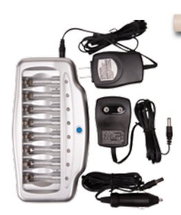
Battery Charger Part No. 1624300