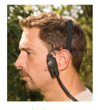
Low Profile Tactical Headset Waterproof to 3 meters. Part No. 1624500