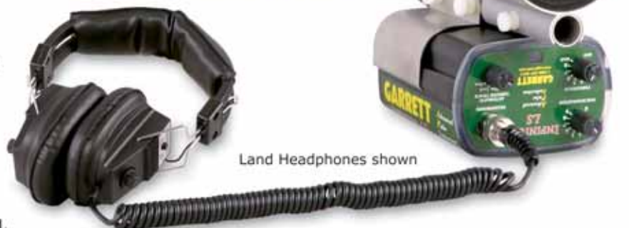
Land Headphones shown